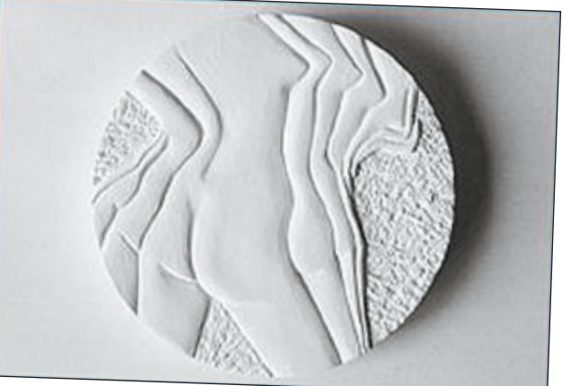
At left is "Wood's Edge 11" watercolor painting and above is "Summer Frolic #9," cast hydrostone.