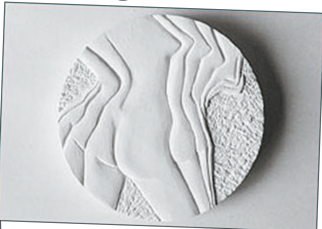
At left is "Wood's Edge 11" watercolor painting and above is "Summer Frolic #9," cast hydrostone.